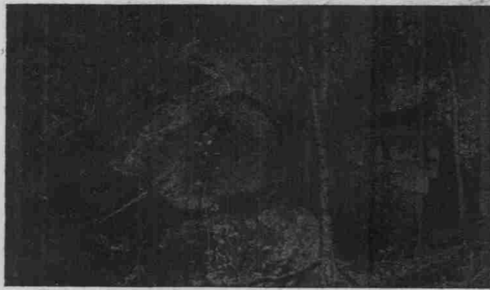
Rolling Rock, Near Greensboro.