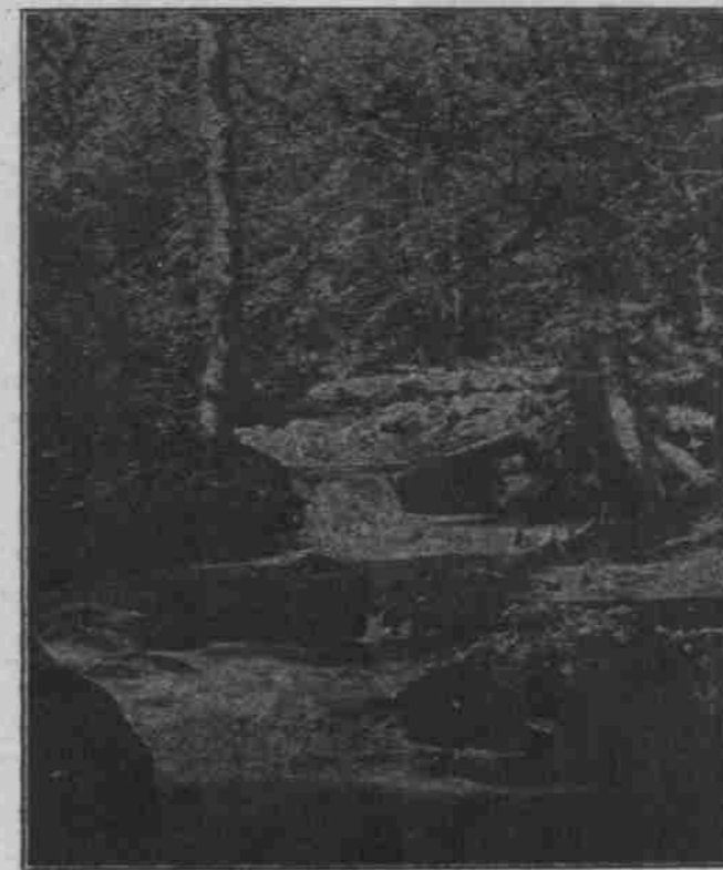
Outlet of the Lake.